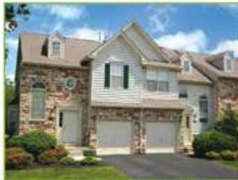
Heritage Summer Hill Signature Drive, Doylestown, PA 18902