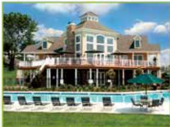
Heritage Orchard Hill - Clubhouse 1 Applewood Drive, Perkasie, PA 18944