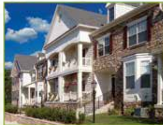
Heritage Greene 807 Ridgeview Court, Sellersville, PA 18960