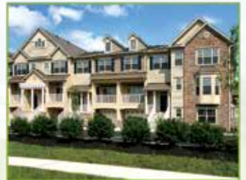
Heritage Pointe Village Way, Chalfont, PA 18914