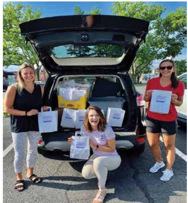
The Parks and Recreation Department about to deliver week one bags