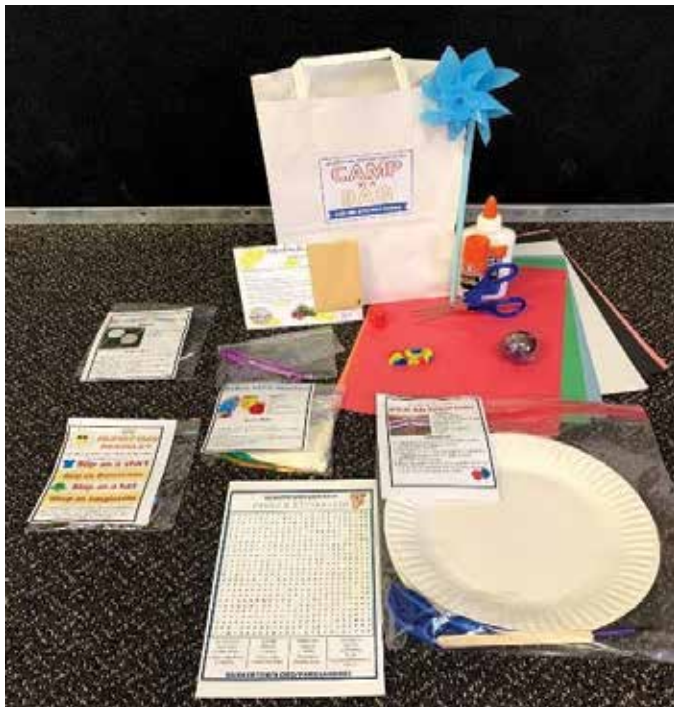
A sample of week one's Camp in a Bag