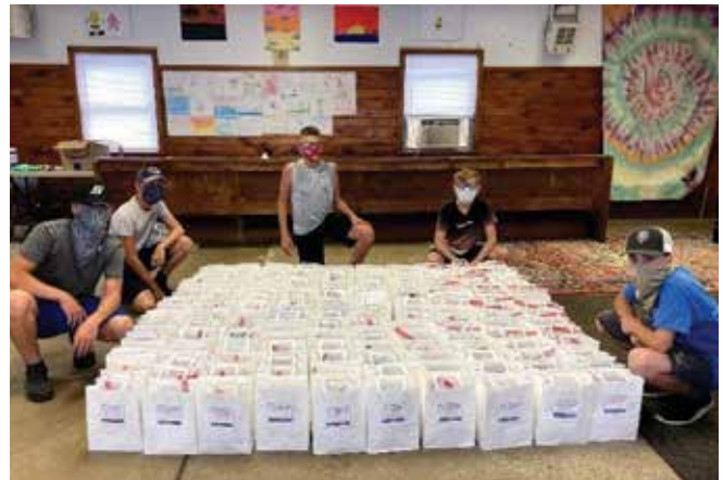
A Special thank you to our Counselors in Training for helping prepare the bags.

Quakertown Borough Parks and Recreation partnered with families, local businesses, and organizations in order to offer these camp bags to families in need. Businesses and families helped by either providing materials for crafts and activities, or through a monetary donation. Without the support of our community we would not have been able to make this happen. Thank you!