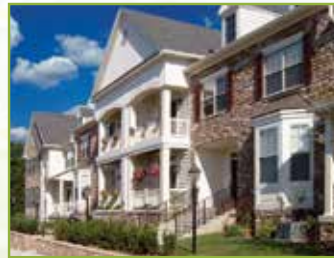
Heritage Greene 807 Ridgeview Court, Sellersville, PA 18960