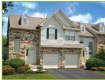
Heritage Summer Hill Signature Drive, Doylestown, PA 18902