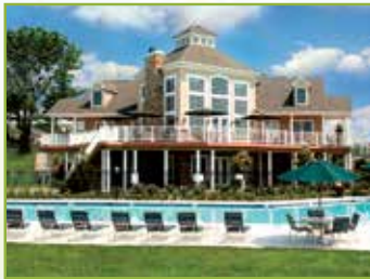
Heritage Orchard Hill - Clubhouse 1 Applewood Drive, Perkasie, PA 18944