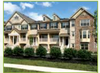
Heritage Pointe Village Way, Chalfont, PA 18914